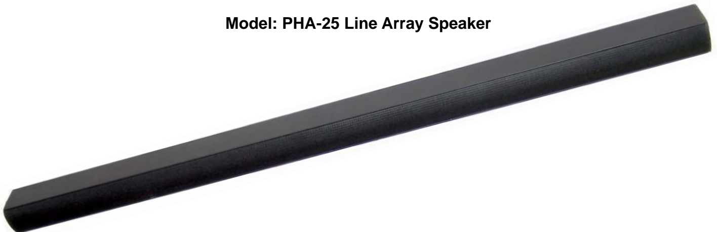
Model: PHA-25 Line Array Speaker

Power Handling: 10 - 288 watts Frequency Response: 120Hz - 20kHz Sensitivity: 96dB @ 1W/1M Impedance: 4-ohm Dimensions (HxWxD): 42" x 2" x 2" Weight: 6 lbs. Finish: white or Black anodized aluminum Grille: perforated aluminum